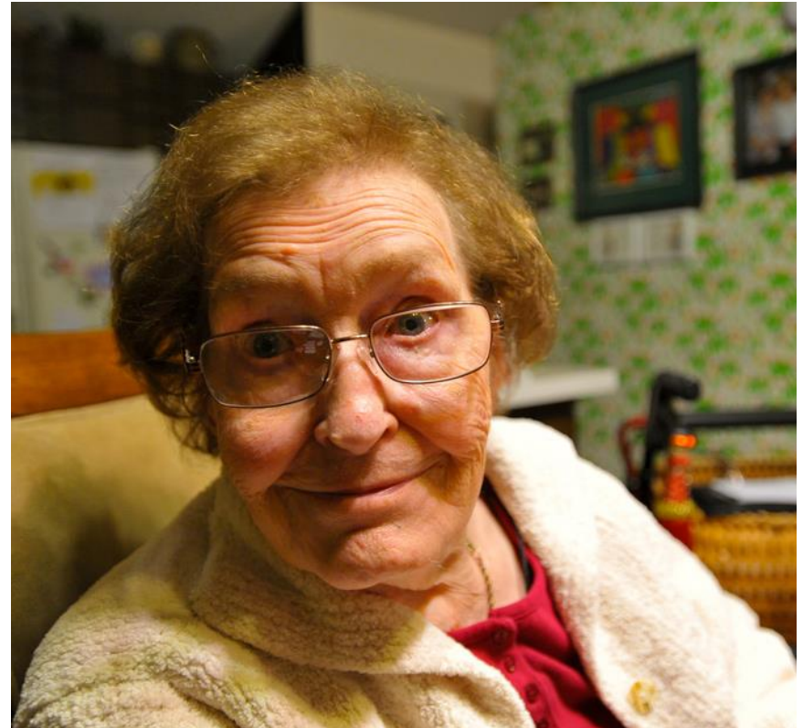
Salt Lake Grandma